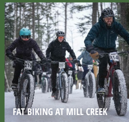
FAT BIKING AT MILL CREEK

Spanning 58 kilometres, with a direct connection into Fundy National Park, the Dobson Trail takes three-days of winding and weaving through vast wilderness and varied terrain to complete in its entirety. Whether you're looking for a challenging footpath, or a place to enjoy a brisk walk, the Dobson Trail delivers and then some.