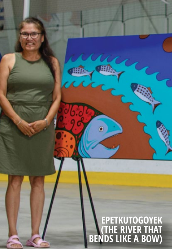
EPETKUTOGOYEK (THE RIVER THAT BENDS LIKE A BOW)