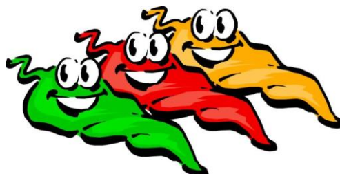
Table # _____