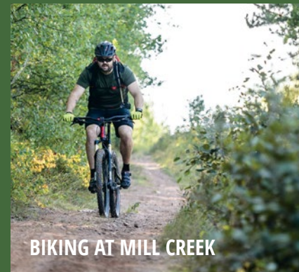
BIKING AT MILL CREEK

Spanning 58 kilometres, the Dobson Trail takes three-days of winding and weaving through vast wilderness and varied terrain to complete in its entirety. Whether you're looking for a challenging footpath, or a place to enjoy a brisk walk, the Dobson Trail delivers and then some.